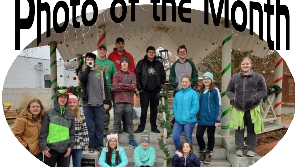
Merry Gazebo Decorating! A jolly group of hangers, rollers, and ladder climbers turned out to jump start the Davenport Christmas spirit! Not pictured are some of the hot chocolate drinkers and advice givers.