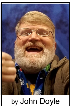
by John Doyle

We're looking for about 4 people to bring Chili/Wings/etc. Everyone is asked to bring some kind of munchies or dessert. Wear your colors. Good manners are optional.