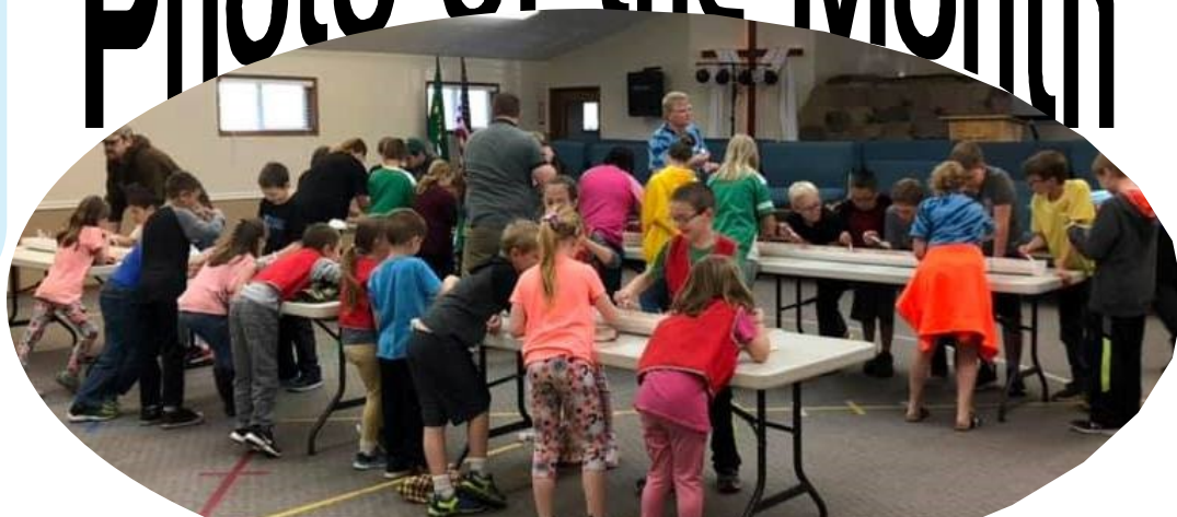
Photo of the Month

We said grace, and Amen meant go! If it's true that God can even bless banana splits, then these kids were truly blessed. Awana wraps up in mid-May, but we're going out with a bang!