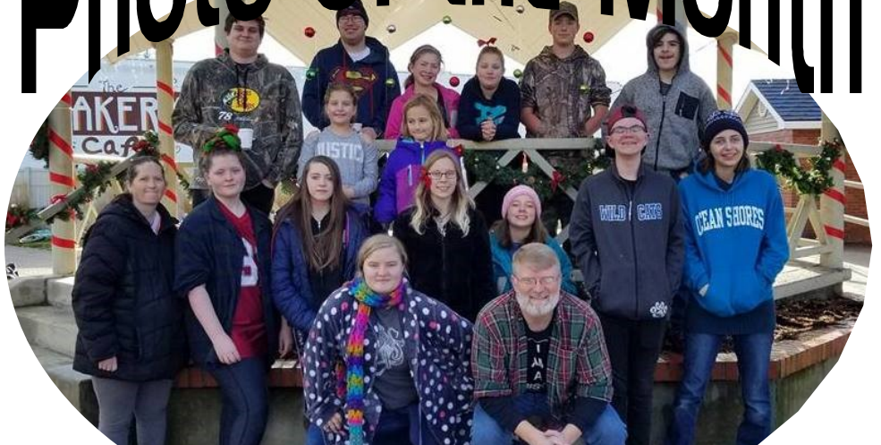
Mission accomplished. Drive by the Davenport Gazebo at night to appreciate the good work the kids did decorating before Hometown Christmas.