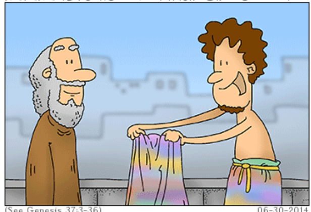
HEY THANKS DAD, THIS WILL GO SWELL WITH MY PANTS OF MANY COLORS

Prefer to get your Newsletter by email? We can do that! Contact the church office at tbfdavenport@ hotmail.com