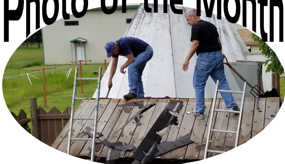
Photo of the Month

How many pastors does it take to put on a 12' roof? We probably could have used one more! This was an early part of the fort repair and remodeling we are doing. The next work day is May 5th. Hope you can join us.