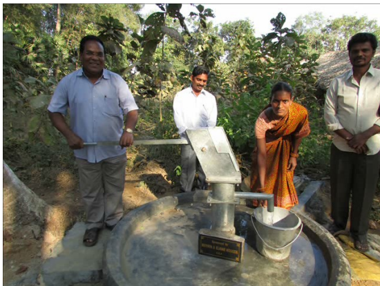
The well we sponsored last year